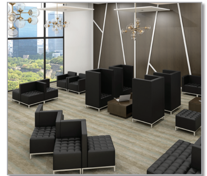
Contemporary & Chic Style For Any Collaborative Space