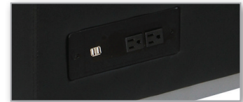
(2) USB Ports, (2) Power Outlets, & 19' Power Cord